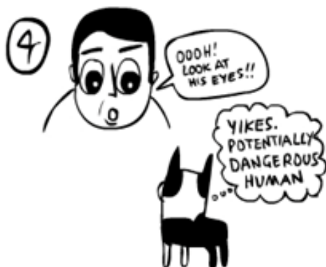
DON'T Stare him in the eye (This is an adversarial gesture)