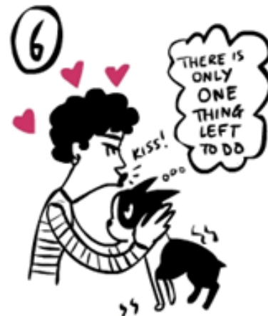
DON'T Grab his head and kiss it (This is an invasion of space)

Doing this to a dog who doesn't know you is like a perfect stranger giving you a great big hug and kiss in an elevator. Wouldn't that creep you out? And wouldn't you have the right to defend yourself?