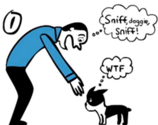
DON'T Lean over the dog & stick your hand in his face

Most people do this stuff and it stresses dogs out so they BITE! I don't care how cute you (or your kid) think Boogie is. Please show him some respect.