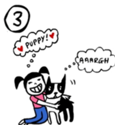
DON'T Grab or Hug him