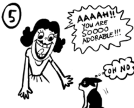
DON'T Squeal or shout in his face