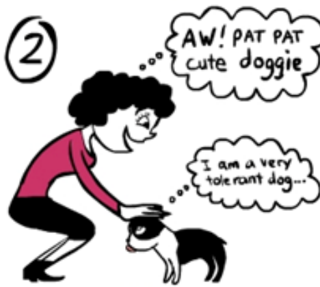
DON'T Lean over the dog & stick your hand on top of his head